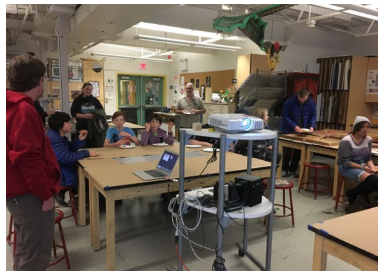
Lunch and Learn: HS Lecture Series