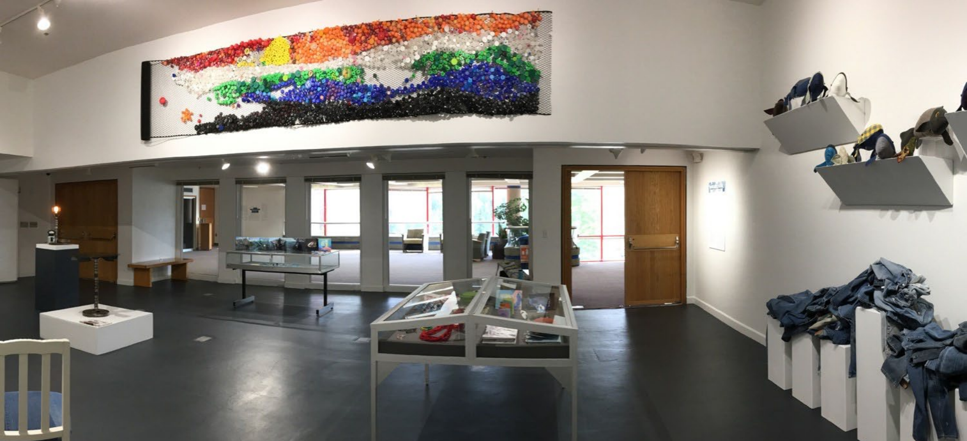
Art Exhibit, UAA Kimura Gallery (2019)