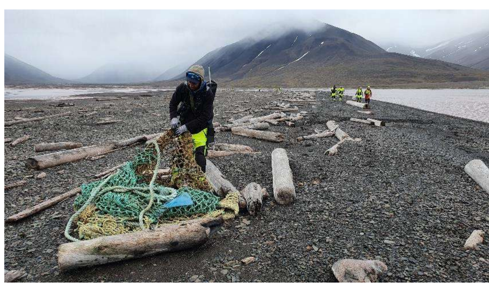
Clean-up Norway Svalbare